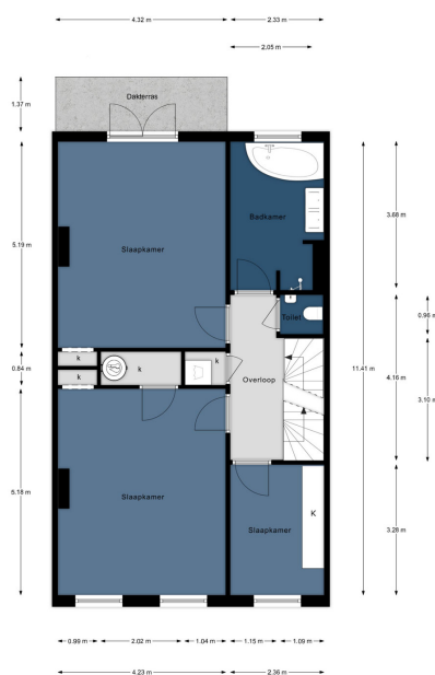
Alphenstraat 60, Den Haag | 2e Verdieping H = 2,98 m