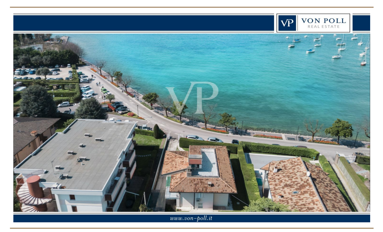
LIVING SPACE: ca. 170 m<sup>2</sup> • ROOMS: 6