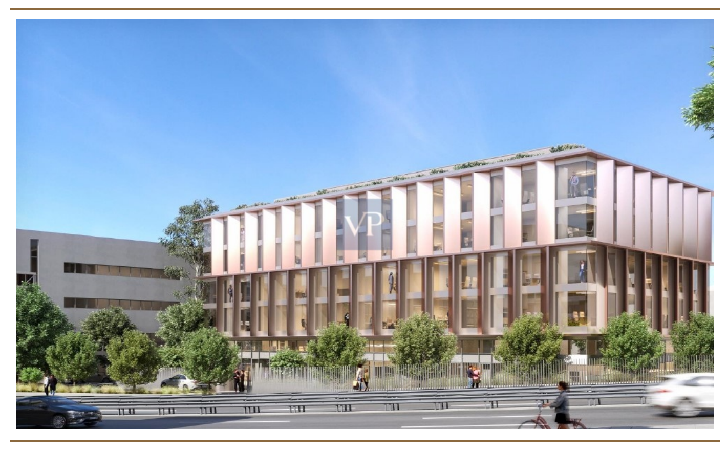
RENT PRICE: 24.599 EUR