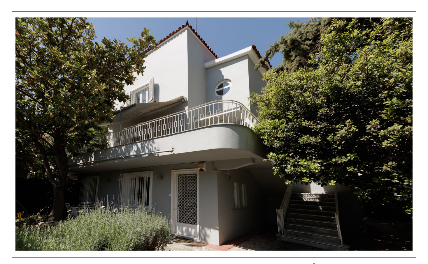
PREÇO DE COMPRA: 4.500\ EUR • ÁREA DO TERRENO: 600\ m^2